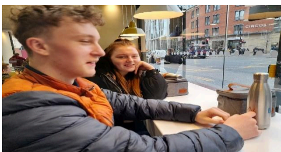
“Childhood education is a precious time that should be fun and nurturing. It is a time to explore, learn, and grow. We should encourage children to enjoy education and seek their own true potential”